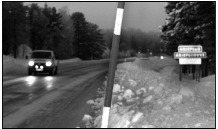
These luminous reflector sticks on the side of road have been replaced by little bushes in many places but hopefully will be put back next season.

In some areas the reflector sticks on the side of the road have been replaced with little bushes! This is an attempt by the Road Administration Board (Vägverket) to save money.