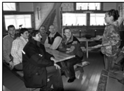
Car testers visiting the wooden hut at Skeppsudden.

They are there every day between 11.00-14.00 where you can meet them, discuss various activities, drink coffee or have a meal.